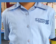
GIRLS - Year 0 - 6 Light blue

THESE ARE THE SCHOOL SHIRTS AVAILABLE @ THE WAREHOUSE PLEASE ENSURE YOUR CHILDS UNIFORM IS NAMED