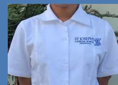
GIRLS - Years 7&8 White